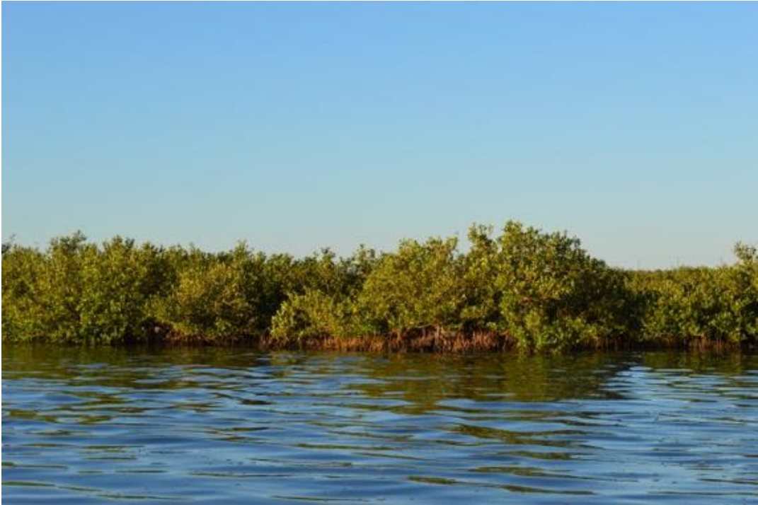
Mangroves on the Texas Coast stabilize shorelines and help absorb storm surge; an example of a non-structural flood mitigation solution.

The implementation of actions, including both structural and non-structural solutions , to reduce flood risk to protect against the loss of life and property.