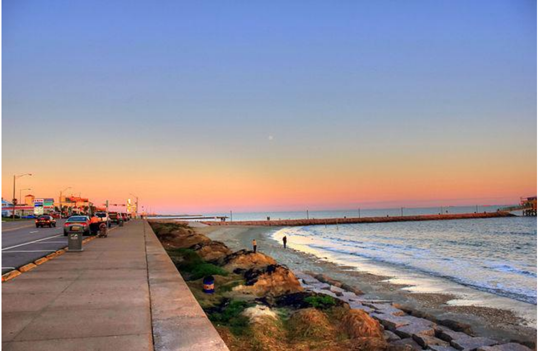
Galveston Seawall, a structural flood mitigation solution.